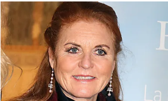
Sarah Ferguson makes important announcement following ski break with...