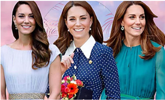
40 Kate Middleton's favourite brands as she turns 40 - Visit the Kate...