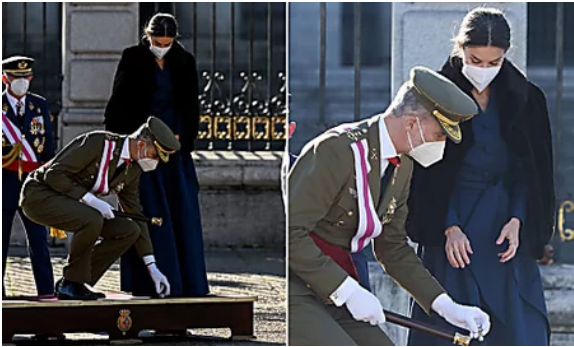
Queen Letizia almost loses precious jewel on first day back at work